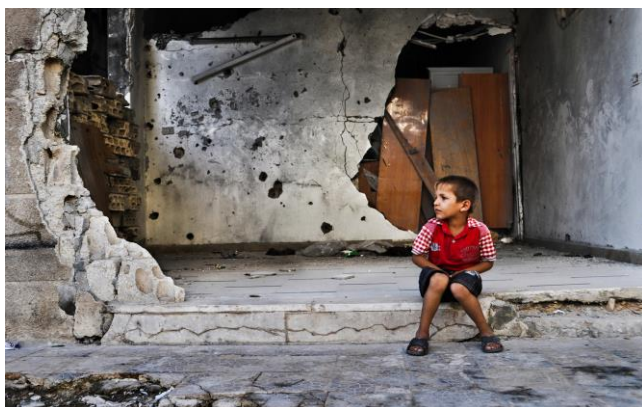
Figure 1: Humanitarian impact of conflict